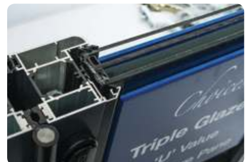
Triple Glazing upgrade available (door 'U' Value 1.5)