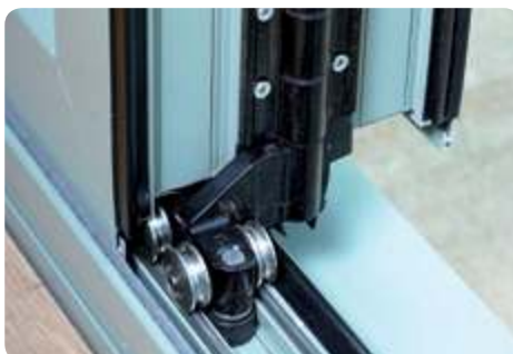
Stainless steel wheels