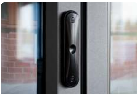
Flush line pop-out handle